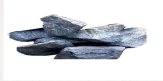
Ferro Silicon Magnesium